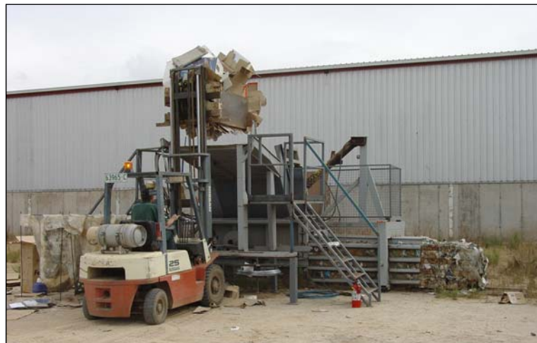
Picture: Jeremy loading the cardboard hopper at West Wyalong for the first SPINS cardboard bale

For more information: www.earthtrends.wri.org