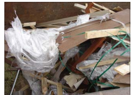
↑ Contamination at the transfer station is still an issue, pictured here: timber, plastic film, cardboard and strapping found in the Garden Waste bin