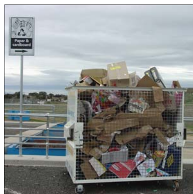
↑ One of the cardboard recycling bins at the Gregadoo Transfer Station